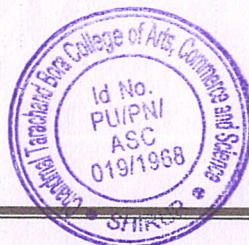
ISO: 14001-2015 CERTIFICATE